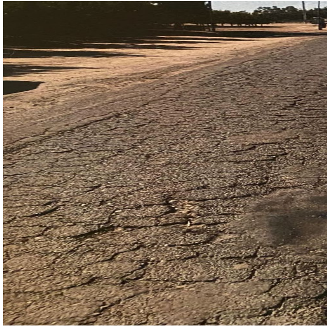
(Figure 1) Fox Road Pavement Deterioration

The two bridges on Yosemite Avenue near Kibby Road still had only one lane in use as shown in the picture below (figure 2). This section of Yosemite Avenue is a rural road utilized mostly by agricultural vehicles and local commuter drivers.