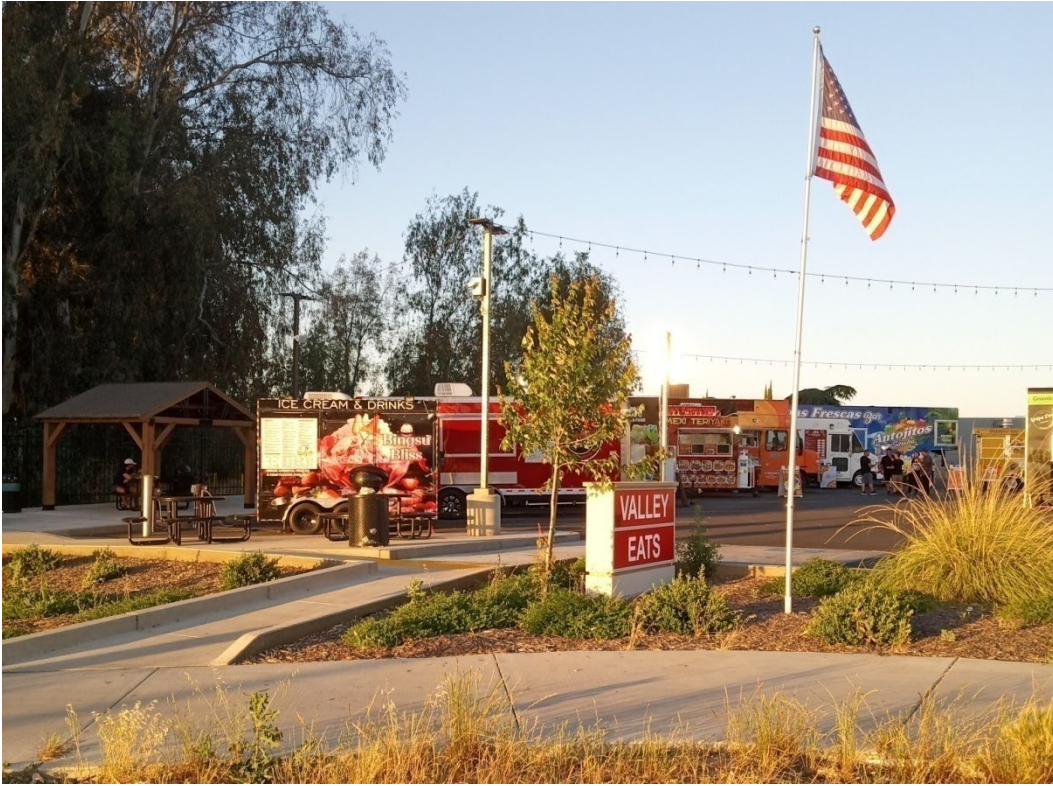
Figure 4: photo of Valley Eats on Hwy 59 and W. Olive Avenue

As of May 19, 2026, the Merced City Council Subcommittee reviewing the municipal code 19 regarding street vendors has suggested changes. They have yet to be acted upon.