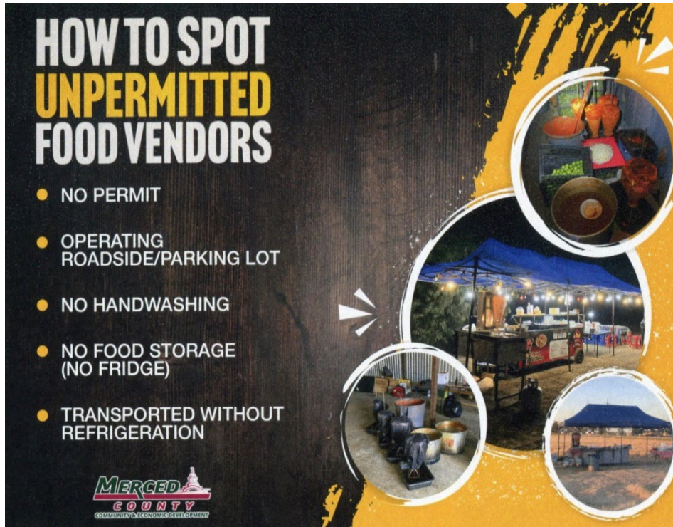
Figure 1: postcard front