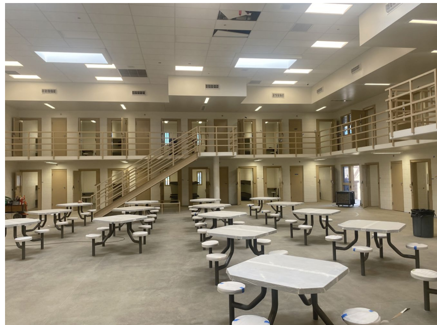
(figure 2) Inside a new pod showing rooms housing two inmates each and common area