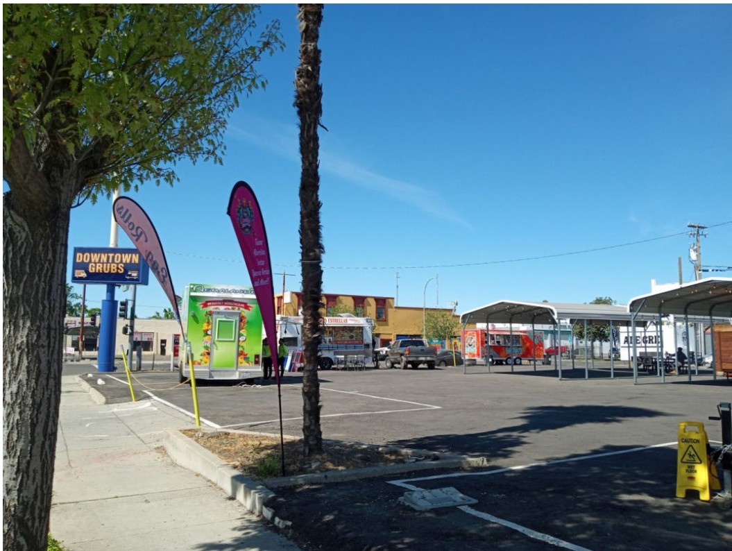
Figure 3: photo of Downtown Grubs on Martin Luther King Way and 16 th Street

As of early 2026, Merced City has two sites available for food vendors. Downtown Grubs is at the intersection of Martin Luther King Way and 16 th Street which has covered table seating. Valley Eats is adjacent to the intersection of Highway 59 and West Olive Avenue which includes a picnic area and restroom facilities. Both offer vendor parking and set up. (See figure 3 below and figure 4 on the next page)