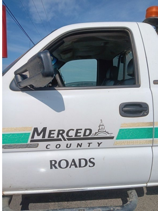
Photo of Merced County Roads Division Work Truck with Logo on the Door