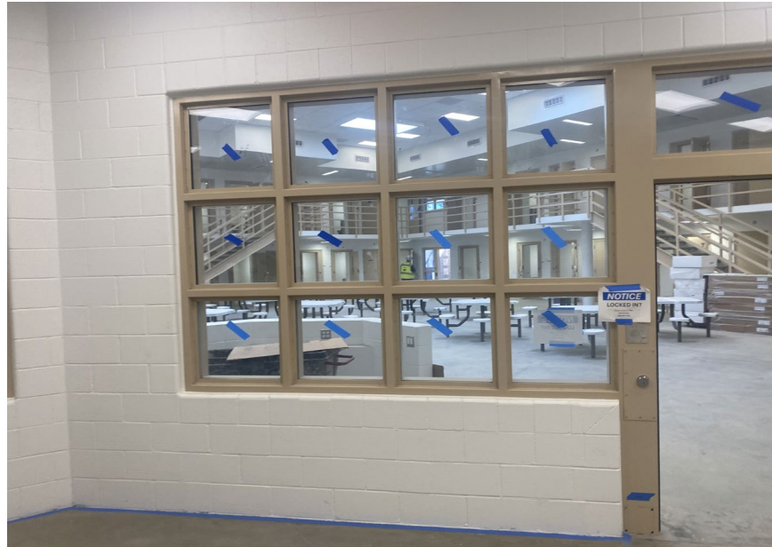
(figure 1) Looking into a new cell block pod from the outside

MCCGJ observed that there was a lack of clear directional signage throughout the area. The facility is very large and there were no visible signs to guide the public to designated parking and visiting areas. Additionally, there was no signage distinguishing between the Iris Garrett Juvenile Justice Correctional Complex (IGJJC) and the adjacent JLCC.