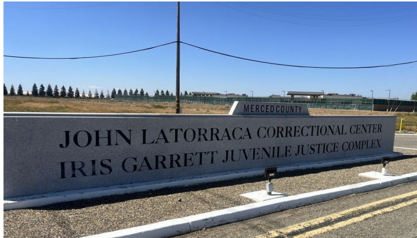
John Latorraca Correctional Center 2025