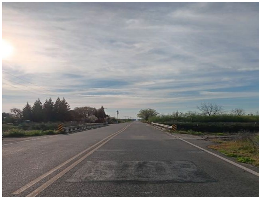
(figure 5) Yosemite Avenue Bridge Completion

The two bridges on Yosemite Road near Kibby Road running over Black Rascal Creek and the Merced Irrigation District Fairfield Canal had been one lane for a very long time. MCCGJ learned the bridge over the canal could not be repaired while there was water running under it. Once MID drained the water, the repair on the bridges was done and the closed lanes were opened up again. This project was completed on March 9, 2026. (See figure 5 below)