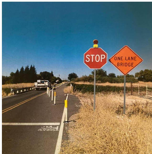
(Figure 2) Yosemite Avenue Bridge Closure